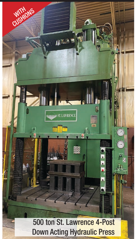
500 ton St. Lawrence 4-Post Down Acting Hydraulic Press

Hydraulic Presses up to 1,000 tons · CNC Machining Centers · Press Brakes · CNC Lasers Rolling Stock · Tool Room · Saws · Air Compressors · Punch Press · Lathes · Welding Equipment Dump Hoppers · Heavy Racking · CMM · Faro Arm · Stake · Trucks