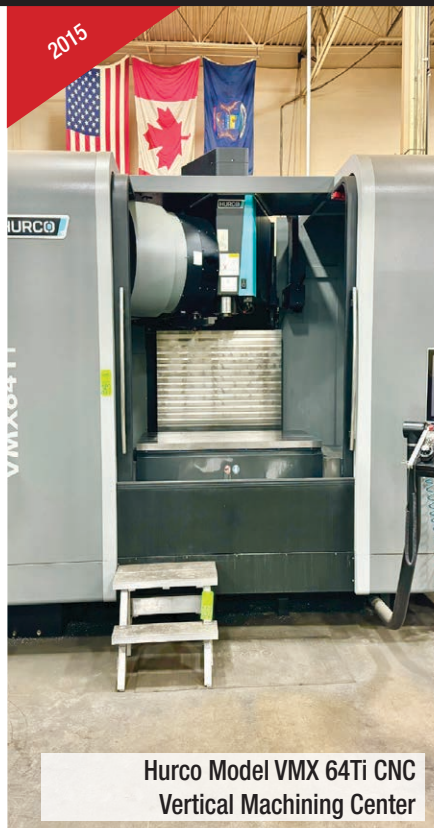
Hurco Model VMX 64Ti CNC Vertical Machining Center