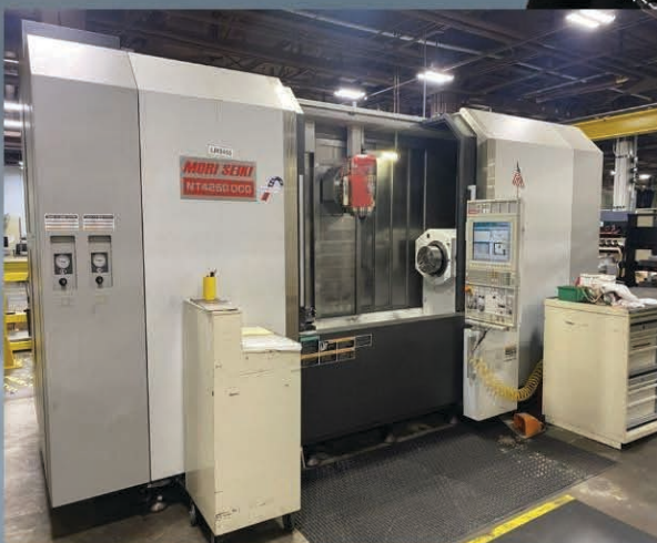
2009 MORI SEIKI NT 4250DCG/1500SZ (5 AXIS)

6000 LEMMON AVE, DALLAS, TX, 75209 INSPECTION BY APPOINTMENT ONLY MUST BE A U.S. CITIZEN TO INSPECT