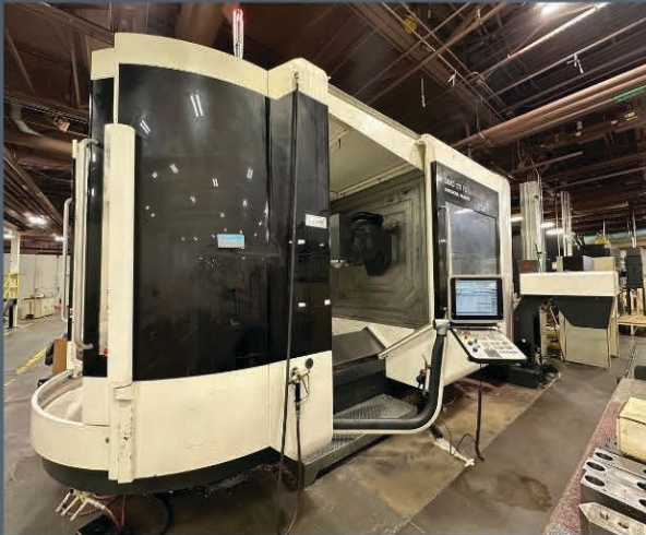
2010 DMG DMC 125FD DUOBLOCK (5 AXIS)