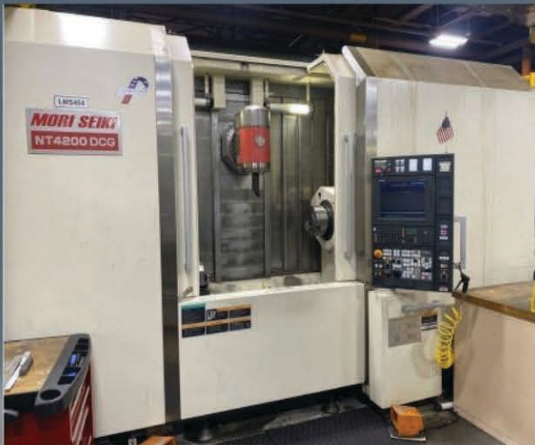
2008 MORI SEIKI NT 4200DCG/1000SZ (5 AXIS)