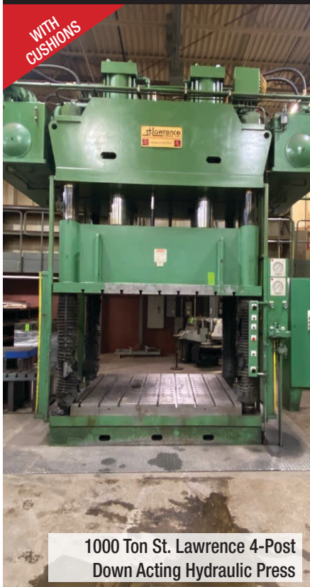
1000 Ton St. Lawrence 4-Post Down Acting Hydraulic Press

Inspection Dates: January 30, 31, February 1, 2 • 9:00 am to 4:00 pm EST each day or by special appt.