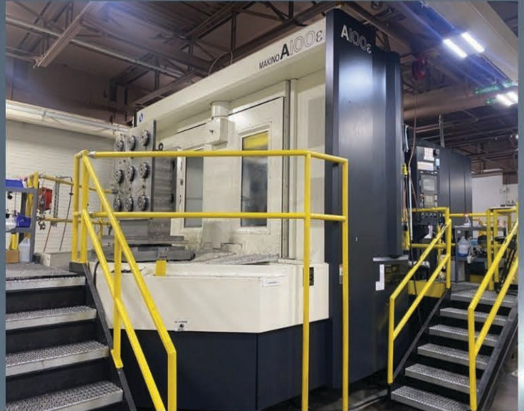
2014 MAKINO A100E HORIZONTAL MACHINING CENTER

6000 LEMMON AVE, DALLAS, TX, 75209 INSPECTION BY APPOINTMENT ONLY MUST BE A U.S. CITIZEN TO INSPECT