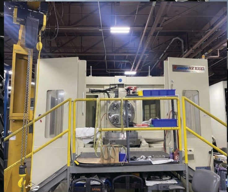
2012 KITAMURA HX 1000I MACHINING CENTER WITH KOMA 5 AXIS